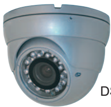
DSIRHRV/S - Silver Casing